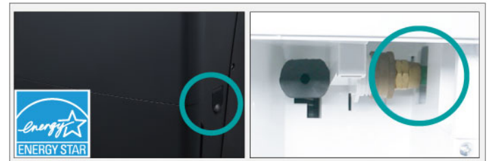
Gravity Draining with Garden Hose (not included)

All product, product specifications, and data are subject to change without notice to improve reliability, function, design or otherwise.